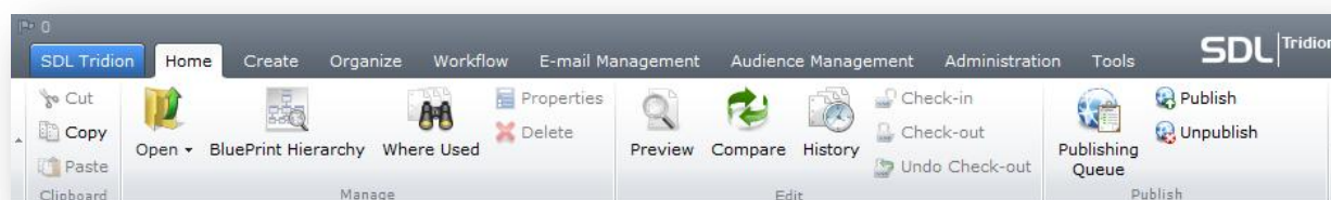
Figure 3: Ribbon toolbar.

The buttons and controls of the main view are displayed in a ribbon as shown in Figure 3. The ribbon is a tabbed toolbar, which contains controls for all the operations you can perform. The extension points of the ribbon and context menus include adding additional tabs and buttons as well as overriding the functionality of existing buttons. The controls of the ribbon and context menu are enabled or disabled based on selections made in the list view below and permissions of the user.