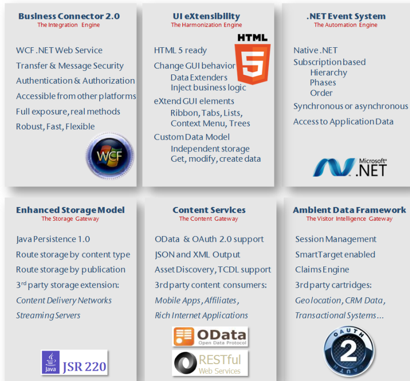
Figure 1: The “Big Six”

The total number of extension points in SDL Tridion is plentiful with a lot of places to hook extensions into. The main ones can be described with what I like to call the “Big Six”. These consist of three extension points on the Content Manager and three on the Content Delivery side as shown below.